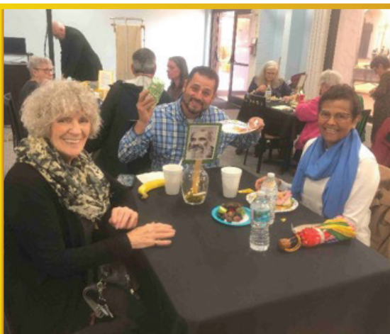
Mother of the Living Gospel