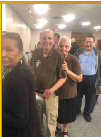
San Damiano in Summerfield